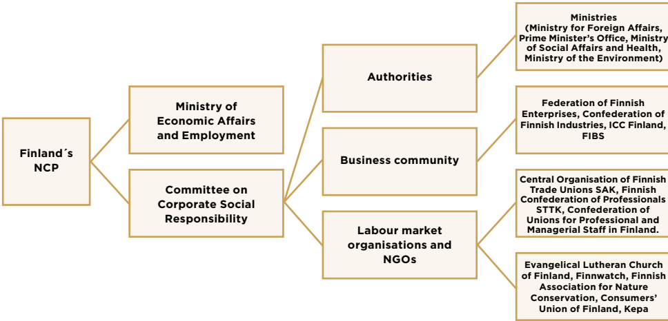
Photo 1. Constituent bodies of Finland's National Contact Point.

The Committee may set up a sub-committee from among its members to prepare the handling of a complaint in a particular case.