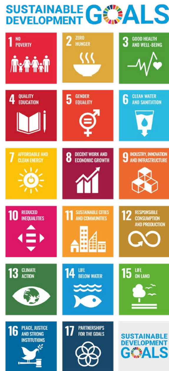
FIGURE 1. The 2030 Agenda goals.

According to the scientific assessment of the global state of sustainable development drawn up by an independent international group of science experts set up by the UN (Global Sustainable Development Report, 2019), the implementation of the Agenda has not moved in the desired direction globally. Instead of individual solutions, the scientists call for breaking down entire systems. The Sustainable Development Goals (SDGs) are closely linked with each other. The growing inequality, climate change and the decline of biodiversity are the greatest problems. The scientists propose that, to lay the foundation for a functioning and capable humanity, we should focus on safeguarding the wellbeing and opportunities of people, with a special emphasis on early