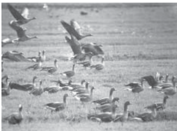
Wild geese on the fields of Olonets.