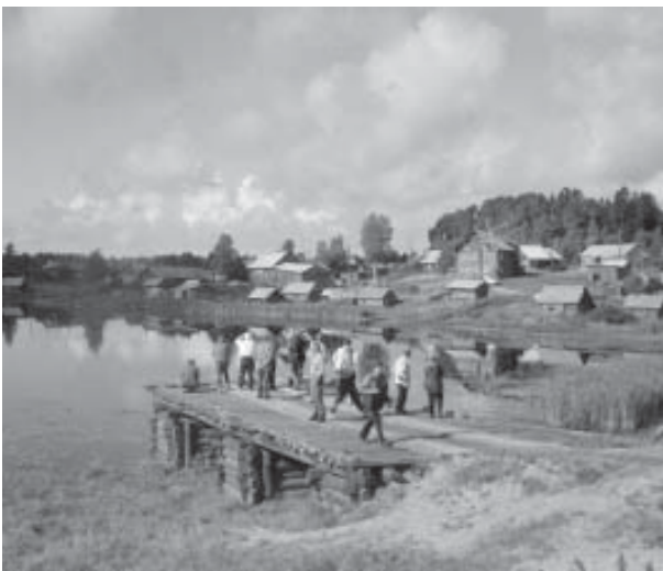
The participants of the outing of the War History Society in autumn 2002 are taking pictures of Nurmoila village in Olonets region.