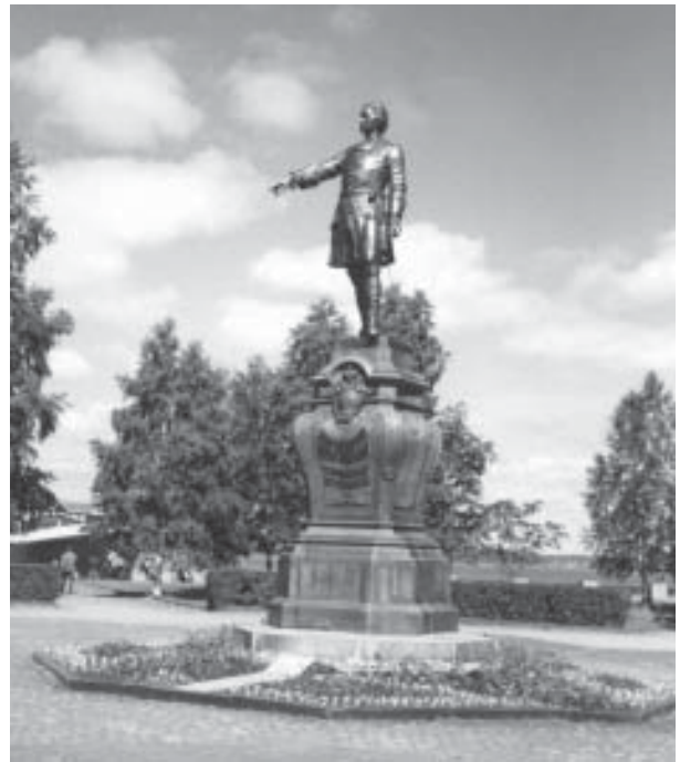
Monument to Peter I in Petrozavodsk.

The project is aimed at the development of cultural tourism based on the ancient history in the broad sense with the help of the specialists from the Kierikki center. The development of museums of the Republic of Karelia is one of the priorities. The participants are unanimous as far as the project aims are concerned. They keep in close contact with each other regularly exchanging information. The project activities include the study of the cultural heritage of the selected regions, acquaintance with museums of Finland, establishment of the network of specialists and information data, development of cultural routes, arranging seminars, training of tour guides and other personnel, publishing activity, creation of the website and marketing. Museums of Petrozavodsk, Kostamuksha, Kem, Belomorsk, Medvezhjegorsk, Olonets and Sortavala together with the Finnish specialists will determine tourist objects along the tourist routes. In March 2003 the project application was sent to the TACIS CBC Small Project Facility Program. The results are expected in September 2003.