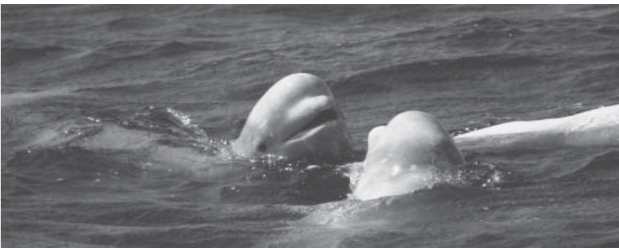
Belugas of the White Sea.

The aim of the project is to organize whale-watch tourist trips to the White Sea. The project is running in the frames of the activities on preservation of natural and cultural heritage of Solovki islands including sea and forest flora and fauna, labyrinths of Zayachy Island, the herbarium of the monastery and Andreevsky Island. The sea biological station, which specializes in whale studying, aims at combining the preservation and