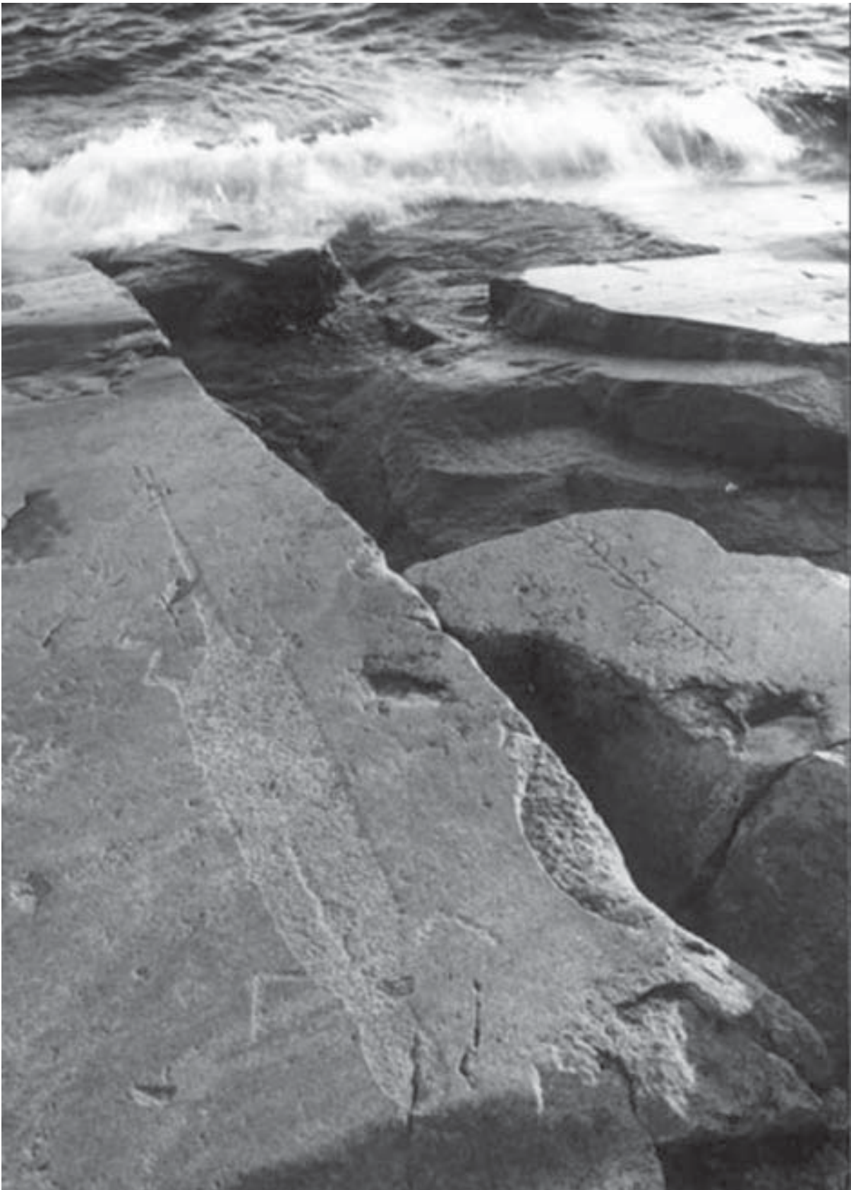
Petroglyphs on the shore of Lake Onego.