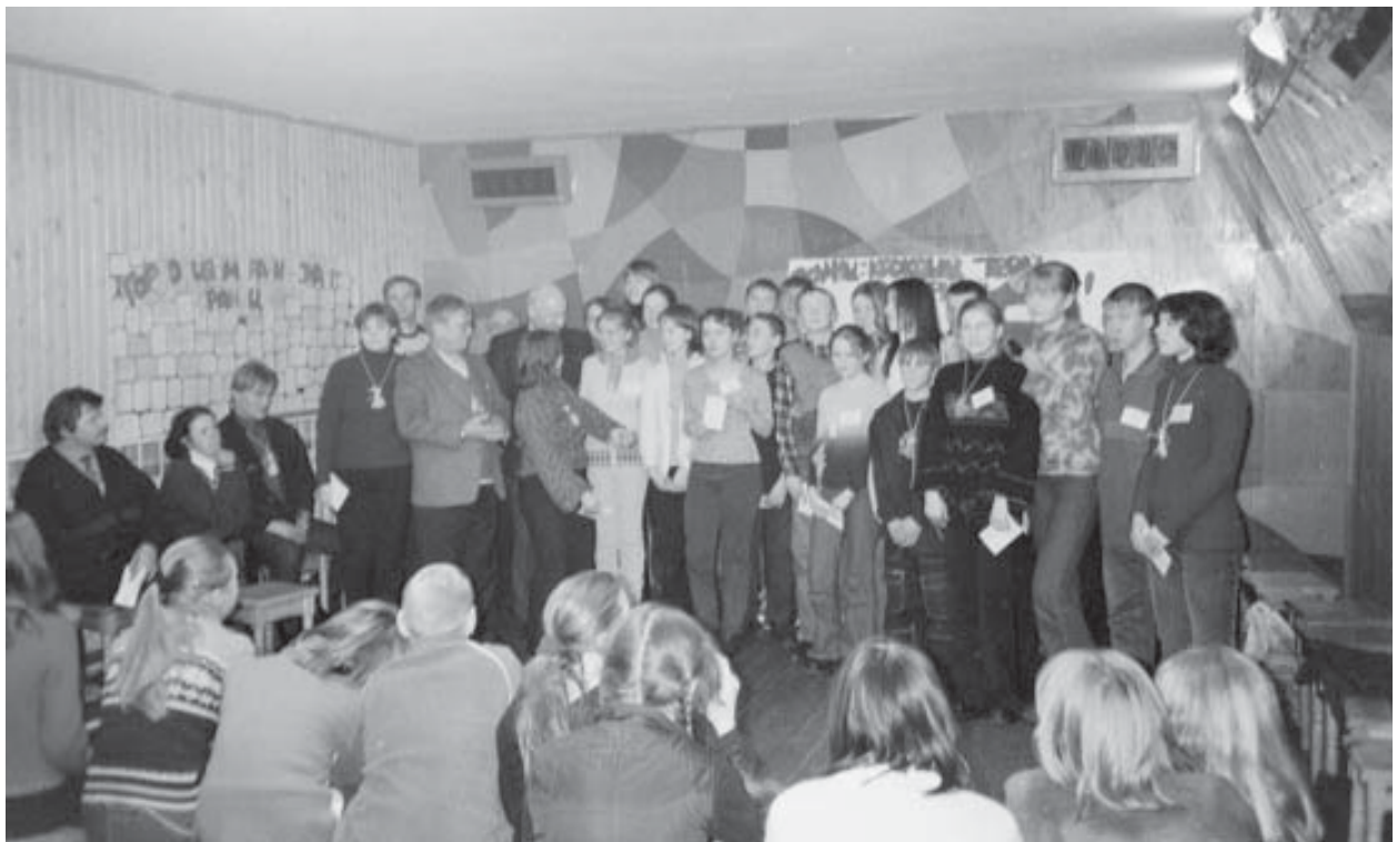
Prize distribution in the frames of the AWARD youth program in Sarkilahti village in January 2003.

Finland allocated seed money to this project. The Ministry of labour and social development of the Russian Federation also guaranteed funding of the activity of youth workshops. In addition the objective of this center is to combine charitable activity on drug prevention with a bigger TACIS project. The Karelian branch of the Academy of public service of Russia is also the coordinator of the project.