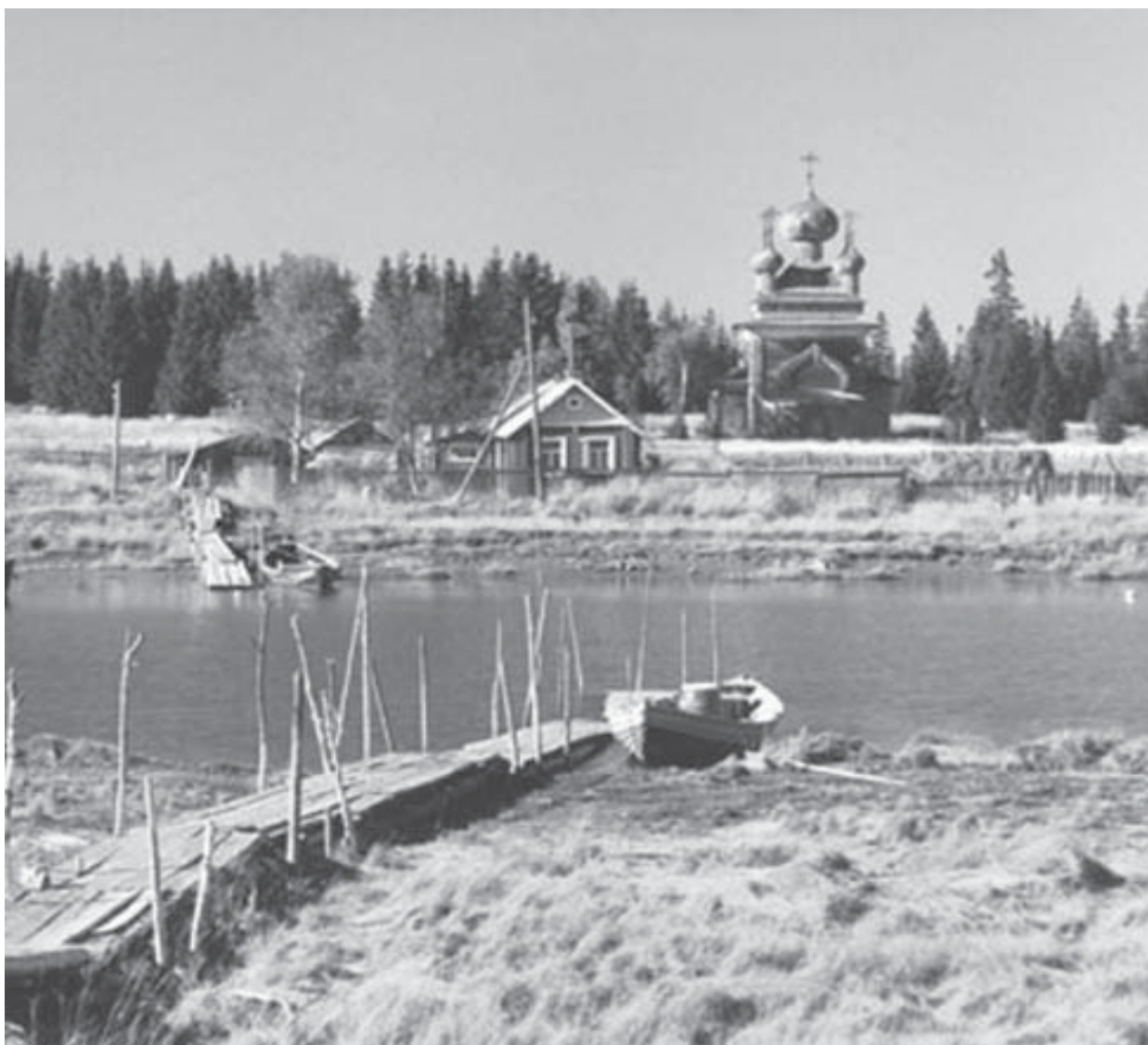
Sts. Peter and Paul's Church in the village of Virma in Belomorsk region.

Republic of Karelia and following the projects' progress is an important stage and a step to the future. Systematization of activities and experience gained from positive and negative happenings create the basis for further information materials.