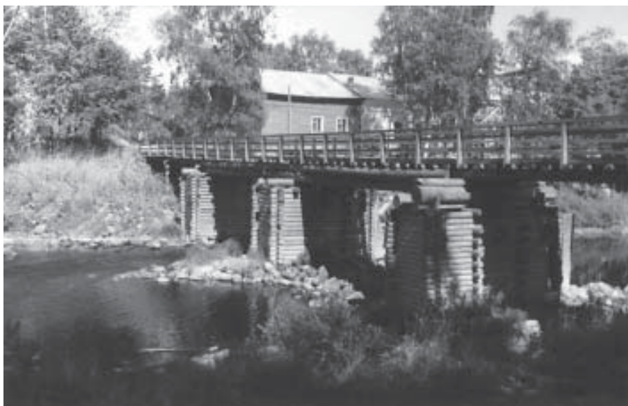
Wooden bridge in Olonets region. Photo of the State Center on preservation and managing of cultural and historical monuments of the Ministry of culture of the Republic of Karelia.